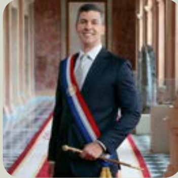
SANTIAGO PEÑA PALACIOS PRESIDENT OF PARAGUAY