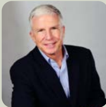
ADMIRAL CRAIG FALLER FORMER COMMANDER, U.S. SOUTHERN COMMAND