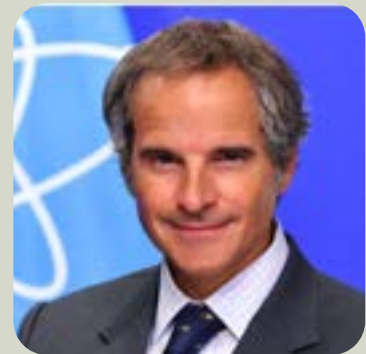
RAFAEL GROSSI DIRECTOR GENERAL, INTERNATIONAL ATOMIC ENERGY AGENCY