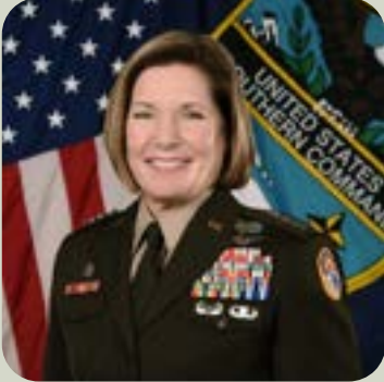
GENERAL LAURA RICHARDSON COMMANDER, U.S. SOUTHERN COMMAND